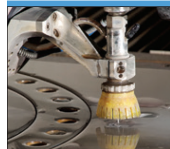
The Waterjet precision cutting requires no secondary finishing processes.